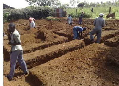
Foundations ready for concrete

An initial sum has been sent to allow the work to start in advance of the team’s arrival and recent reports suggest that the locals have made good progress. The foundations have been excavated and concreted, all work completed manually. Building work has now commenced.