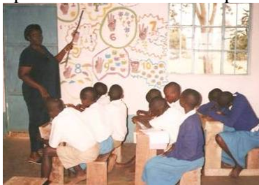
The specialist teacher in the Kayieye school

The Kayieye School has a special needs class specifically for deaf children from the area but they are getting requests from all over Siaya District to take in children who need the care and education that only a specialist teacher and set up can provide.