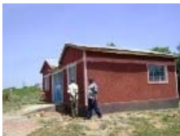
The Completed Barkatado Orphanage Kitchen