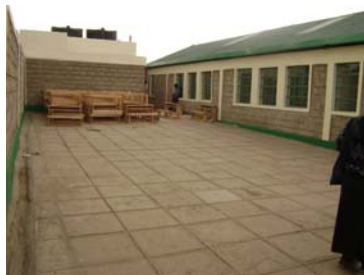
The completed Korogocha School