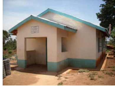
The Dophil Operating Theatre

The 2008 project was the construction of the Dophil Operating Theatre at the Dophil Clinic, also in Western Kenya. The construction of the operating theatre turned the Dophil Clinic into a serious satellite station for the whole region and provides access to surgical needs for a huge number of people. The Dophil Clinic now serves more remote parts of the Siaya region, so that those needing minor surgical procedures can be attended to without long journeys – many of which are not often made and as a result simple procedures develop into critical illnesses. The theatre is now in use and regular reports are received from 'Dr Phil' on the work load.