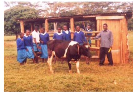
The Granaghan Cow

who take Agriculture as a major subject for examination or would like to become farmers in future."