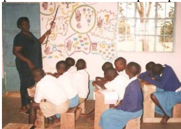
The specialist teacher in the Kayieye school

Granaghan Outreach is now in its fourth successful year and is continuing its work in Western Kenya. The project for 2009 has been identified and preparations are well under way with continued help from Moving Mountains. The project is the new build of a dormitory at the Kayieye School which is in the same region visited in previous trips. Kayieye has a special needs class specifically for deaf children from the area but they are getting requests from all over Siaya District and further afield to take in children who need the care and education that only a specialist teacher and set up can provide.