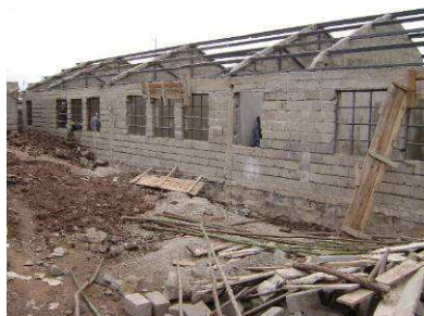
The Korogocha School well underway to completion

Granaghan Outreach was able to provide a donation of £10,000 in January 2008 to get this project started, while substantial local support was provided to reach the target cost. Regular progress reports of the construction are received with the four classroom building ready for the roof.