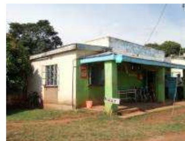
The Existing Dolphil Clinic

The construction of the operating theatre for Dolphil will turn this clinic into a serious satellite station for the whole region and provide access to surgical needs for a huge number of people.