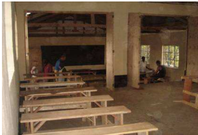
Finished class room with new floor, doors, desks and windows

In October 2006 a team from the parish travelled to Siaya Town in Western Kenya to take part in the renovation of the 'Nyasidhi School.' Five classrooms were to be renovated, and while each room was built, it did not have doors, windows, floors or plastering. Each time it rained, the clay bricks disintegrated, and with the roofs leaking the floors often turned into mud. The work was successfully completed during a two week stay.