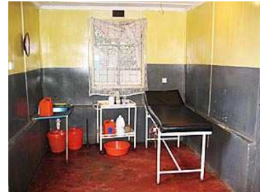
Delivery Suite at the Ushirika Clinic

During the 2006 trip the team visited a clinic in the slums of Nairobi. The Ushirika Medical Clinic was established and is supported by Moving Mountains. Granaghan Outreach have been able to fund the provision of medical equipment at the clinic.