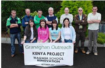
Team Kenya 2007 on departure