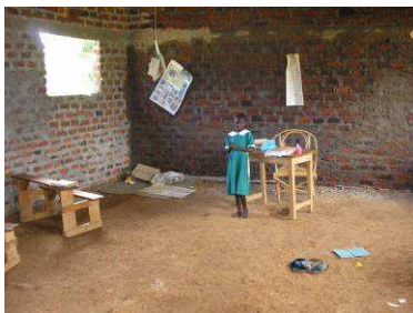
Typical conditions of one of the secondary classrooms at the Wagwer school

The 2007 project was the renovation of four secondary classrooms at ‘Wagwer School’. Conditions at this school were awful with many of the buildings with no windows, doors, desks or floors. Bare footed children are often attacked by ‘jiggers’, insects which burrow their way into the soles of their feet.