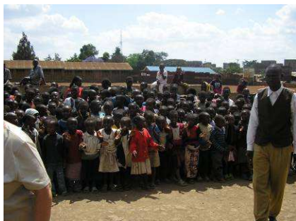
The team were met by over 150 children