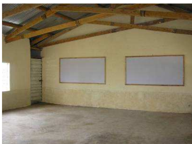
One of the completed classrooms

The team stayed in ‘Mwishi Mwishi’ Hotel, which was relatively clean and very basic. Electricity was available most evenings, while warm water ran out more evenings than not. Mosquito nets were essential for sleeping, although in some cases the mosquito’s found a way through! The school was only a few miles from the hotel.